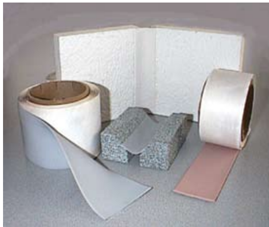
Fig. 1: Precured silicone sealant

Several types of precured joint sealants have been used in the industry over the years, ranging from polyurethane and polysulfide to silicone. Each type offers unique chemical and physical characteristics. One type is silicone precured joint sealants, which are used in construction applications for several reasons. First, because of their molecular structure and high bond energy, silicones have excellent aging characteristics and are more resistant to ultraviolet light and weathering. Because silicones do not degrade when exposed to the elements, it is possible for manufacturers to produce the material very thin (0.04 to 0.08 in. [1 to 2 mm]). Thin precured joint sealant minimizes expansion and contraction forces on the substrate and creates the pleasing appearance of a flat profile. Additionally, the movement capability for silicone precured joint sealant can be as high as +200%/–75%. This combination of high movement capability and thin material allows precured silicone sealant to easily handle multidirectional movement. Additional advantages include a wide operational temperature range and a better resistance to color fading.