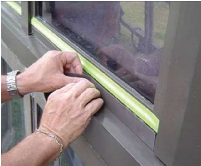
Fig. 5: Precured silicone sealant installed in an aluminum window system