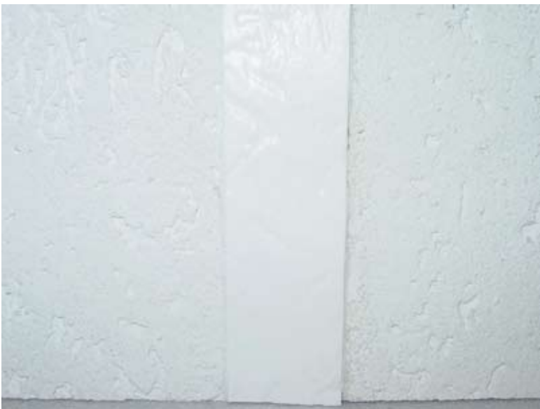
Fig. 4: EIFS joint repaired using textured precured silicone sealant

need to be tooled after installation. Each of these factors can help reduce project costs when using precured sealant.