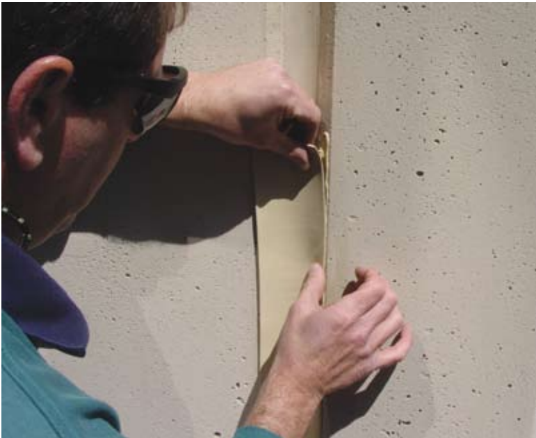
Fig. 3: Repair joint installation